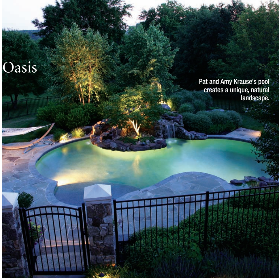
Pat and Amy Krause's pool creates a unique, natural landscape.

Pat knew he wanted it to be unique and to look as natural as possible—not just a typical pool stuck into the ground. "I like rocks, I like plants, I like water," he says. And, he wanted to hear the soothing sound of running water so he contacted Browning Pools to install a free-form pool.