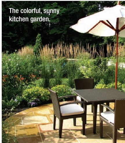
The colorful, sunny kitchen garden.