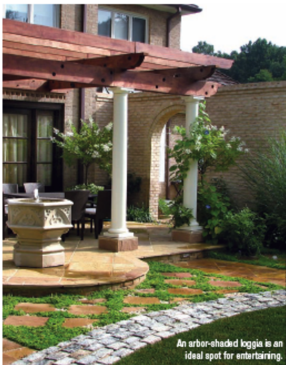
An arbor-shaded loggia is an ideal spot for entertaining.